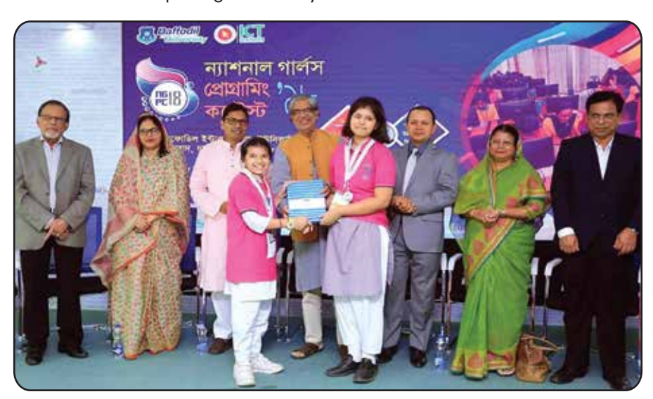
Natinoal Girls Programming Contest at Chandpur School