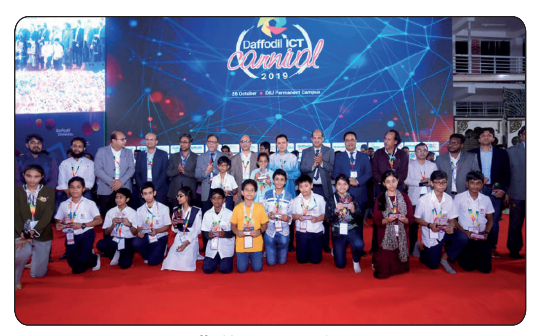
Daffodil ICT Carnival 2019